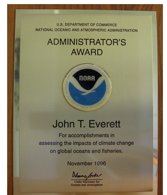
NOAA: For ... assessing the impacts of climate change on global oceans and fisheries